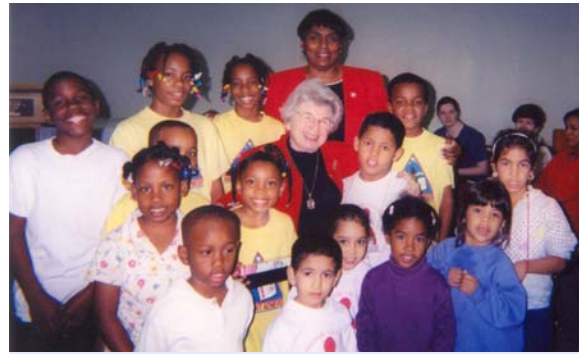
Can you name this famous HIPPY supporter?