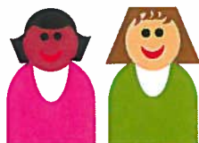
Home Visitor to Parent