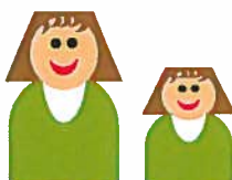
Switch Roles as Parent and Child