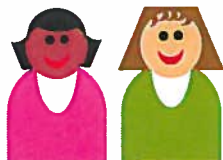
Home Visitor to Parent