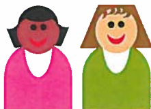
Home Visitor to Parent